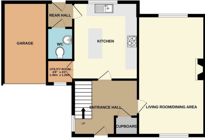
GROUND FLOOR 668 sq.ft. (62.0 sq.m.) approx.